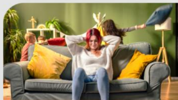
HYPERACTIVITY & ANXIETY