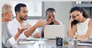
FOCUS & STRESS